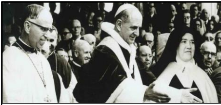
Pope Paul VI is pictured next to Lucia dos Santos, one of the three Fatima visionaries